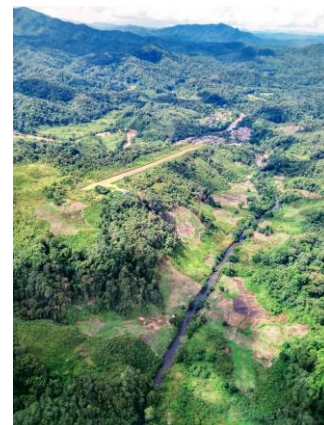
Village and airstrip of Long Sule

Due to Covid-19, Indonesia, like many other countries, hadn't been processing new work visas. Since the start of the school year on September 3 rd , we have only had one teacher for the 1 st through 12 th grades. The kids have been going to school half days. 4th-12th grades go in the morning and 1st-3rd go in the afternoon. Math, science, and language arts are done at school and other classes are done at home. Just in the last week however our other teacher arrived in country and is currently following a mandatory 2-week quarantine. Plans are that school will go back to full days starting Dec 7,