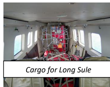
Cargo for Long Sule