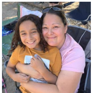
Left: Three generations at Family Camp! Right: A fun day at Lake Gregory, Crestline is part of our annual Family Camp.