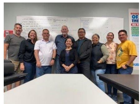
With some brothers and sisters of the Junikuin ethnic group (left)