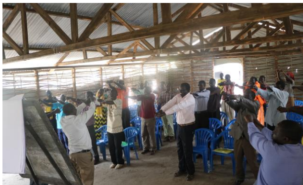
RECONCILE Peace Building Training