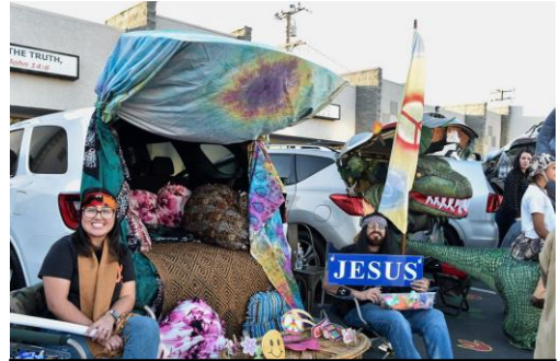
D. Jesus Revolution comes to Trick or Treaters.