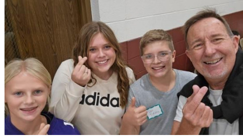
In Iowa with friends.

I apologize to those individuals and congregations with whom I have yet been able to visit! I have set aside time in 2024 for more visits. Until then, please check out this video which I recently made from clips recorded this year to give you a closer look at the people and places related to the ministry.