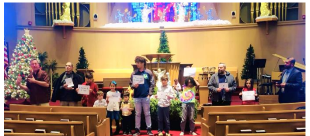
A visit in New Jersey.