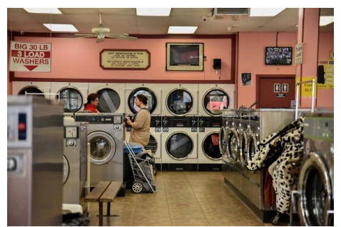
Trash pickup, laundry washing, car washing, and prayer were all a part of our annual Jesus Loves HG outreach to the city of Hawaiian Gardens. The streets were alive with honks as we served the city.