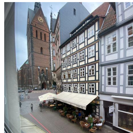
The view from our WCRC office window - the church is the Marktkirche, the Lutheran Church at the very center of the Old Town.